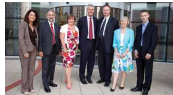
Representatives from OCR, Birmingham Chamber of Commerce, NAS, local employers and colleges share the benefits of Apprenticeships.