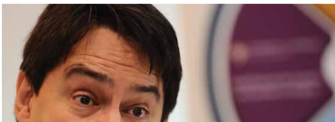
Stephen Twigg MP.

Discussions were frank and also covered topics such as the need for exams at 16, the effects of early intervention, reducing the amount of high stakes testing, the negative effects of using the wrong kind of accountability measures and the potential benefits of training teachers to create their own rigorous assessments. All agreed that teaching beyond the test leads to better grades.