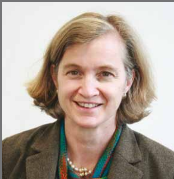
Amanda Spielman, Research & Policy Director of ARK Schools and recently appointed chair of the English exams regulator, Ofqual