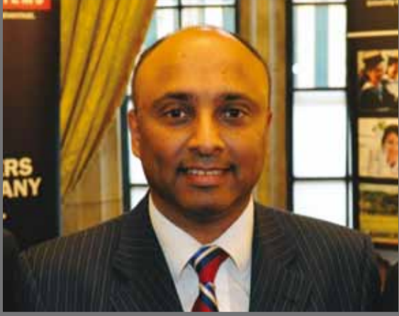
Mark Hendrick MP, Chairman, All Party Parliamentary China Group.