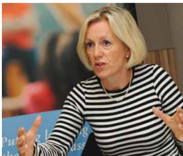
Tessa Munt MP, Member of Education Select Committee.