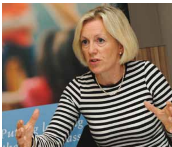
Tessa Munt MP, Member of Education Select Committee.