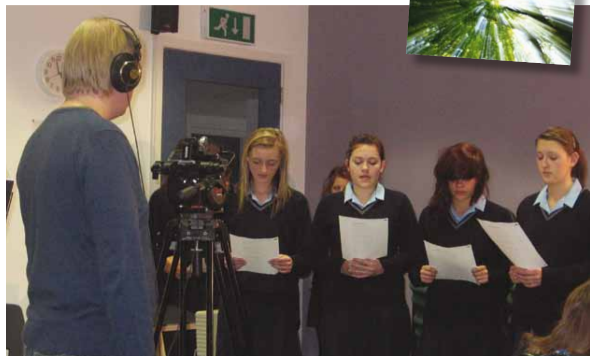
Behind the scenes of 'Virtual Visions'.