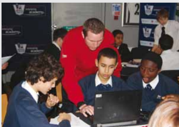
Y9 pupils from Coombe Boys’ School and Raynes Park High School.

The Apprentice-style challenge was part of the Enterprise Academy, a business skills development