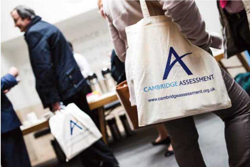
Influencing debate: delegates discuss ideas raised at the Group's event on how to construct a better maths curriculum for England

solution '. Both events saw lively and frank debates about the current and future educational landscape.