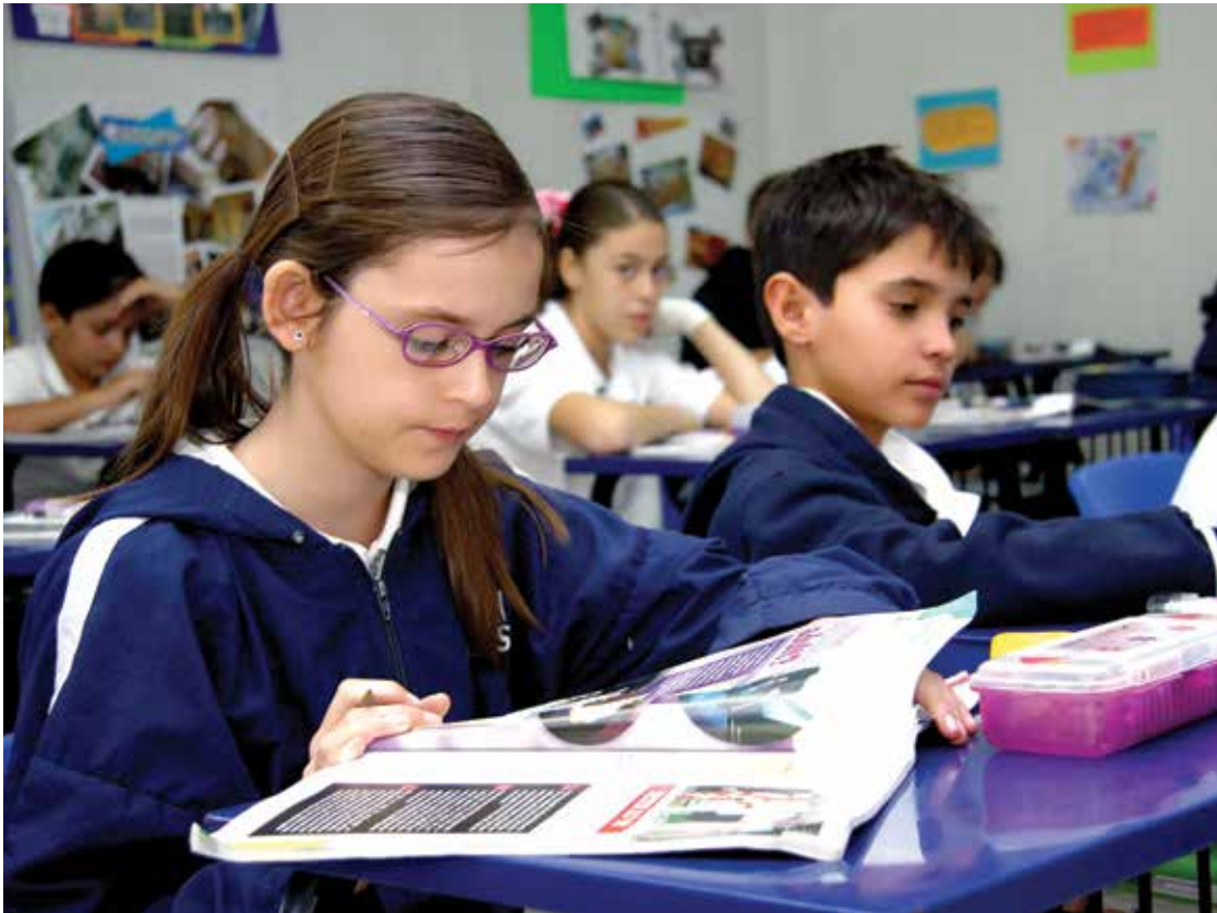
Supporting worldwide delivery of examinations: Students at the International School of Querétaro, Mexico

In Malaysia, a programme for the Council of Trust for the Indigenous Peoples (commonly abbreviated as MARA) is using the Cambridge IGCSE to implement a bilingual dual-certification programme at secondary level. We are working with the Council to help integrate Cambridge programmes into the Malaysian curriculum and to train teachers. We have an important relationship with MARA, a government agency which promotes educational and economic opportunity for Malays and other indigenous peoples, especially in rural areas.