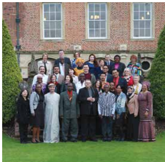
Delegates from 13 countries including Oman, Kazakhstan, Lesotho and Portugal attend the Cambridge Assessment Network International Study Programme

In October Cambridge English Language Assessment held a major event in the European Parliament to encourage greater focus on language learning in European Union education strategy. For the past five years we have been working with MEPs in the European Parliament's Culture Committee and the European Commission's Directorate General for Education, Culture and Sport to focus attention on EU language policy. During this year, we provided advice on prioritising language learning, which was adopted as part of the Parliament's response to the EU 'Rethinking Education' strategy.