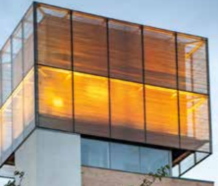
The tower at Cambridge Assessment's new international headquarters.