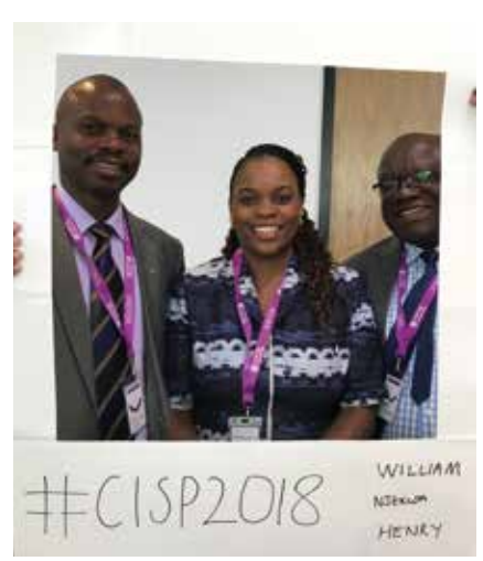
Delegates enjoyed the 'selfie' photo booth on this year's Cambridge International Study Programme.

Delegates braved the early spring chill to go punting on the River Cam.