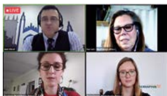
More than 2,000 delegates attended EduTech Africa, held for the first time online.

Cambridge International has been participating in the exhibition, which is normally held in Johannesburg, South Africa, for several years. This year's event was held over three days from 13 to 15 October and was attended by educators, organisations and stakeholders in the education industry from all over Africa and beyond the continent.