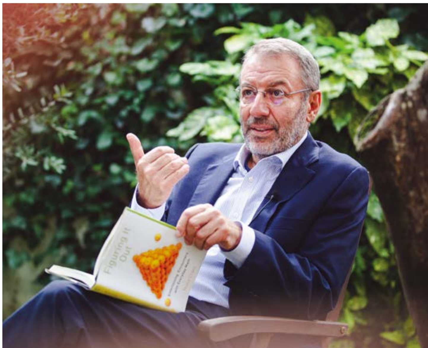
Prof Nuno Crato said that ambitious curricula, aligned assessment and a focus on all students are the key to educational improvement.

Referring to his published work on the country's experience, he said that "everything starts with the curriculum". This meant that schools needed a demanding curriculum, centred on essential subjects