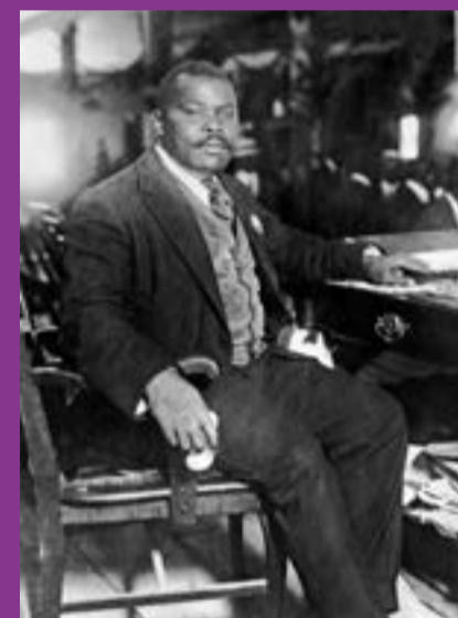
Marcus Garvey seated at his desk, 5 August 1924.

Brought up in Tottenham, I was very lucky to have black history all around me. My father loved history and at a young age had me asking questions about Marcus Garvey as we visited the local library (conveniently named after the black nationalist!). I knew about slavery from my own year 8 history lessons and was very aware of British colonial involvement abroad. I was lucky in my own personal difference (my mother migrating from Kenya to escape persecution and my father from Pakistan in the early 1970s). Both instilled the idea of pride in culture and my own ethnic background – something I have tried to emulate myself – especially now I am a mother to a young child.